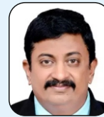
DR JUDO J V